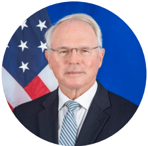
Christopher R. Hill, United States Ambassador to Serbia