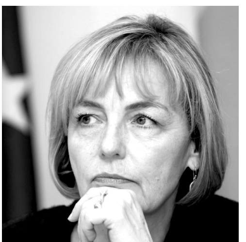
Dr. Sc. Vesna Pusić Member of Croatian Parliament, former Minister of Foreign Affairs of the Republic of Croatia CROATIA