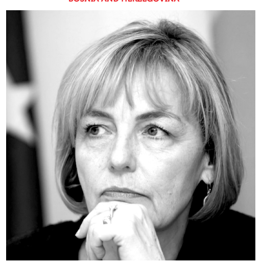
Dr. Sc. Vesna Pusić Member of Croatian Parliament, former Minister of Foreign Affairs of the Republic of Croatia CROATIA