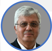
H.E. Prof. Ayman Ashour Minister of Higher Education and Scientific Research BFCE Chair