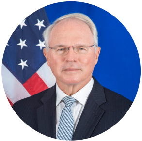
Christopher R. Hill, United States Ambassador to Serbia